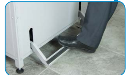
Foot pedal pre-clamp holds paper to check alignment prior to cutting