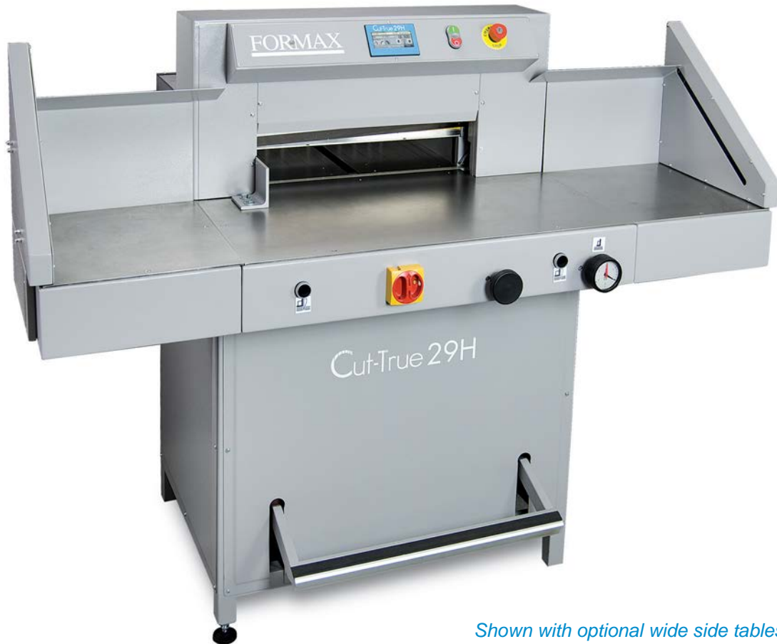
Shown with optional wide side tables

The Formax Cut-True 29H Hydraulic Guillotine Paper Cutter offers precision cutting for paper stacks up to 20.5" wide. User-friendly, intuitive features include a touchscreen control panel, automatically-adjusting back gauge and the capacity to program up to 100 jobs/100 cuts . An infrared light beam safety curtain provides safety and convenience as it shuts down operation if the light plane is interrupted.