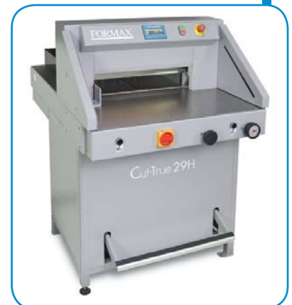
Standard model, without side tables