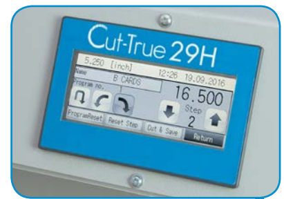
Touchscreen control panel allows for programming up to 100 jobs