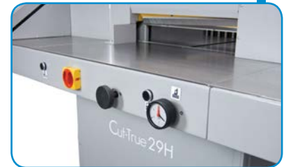
Two-button operation, fine-tune knob, adjustable hydraulic pressure gauge